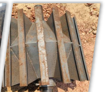
Bucket Elevator Pulley