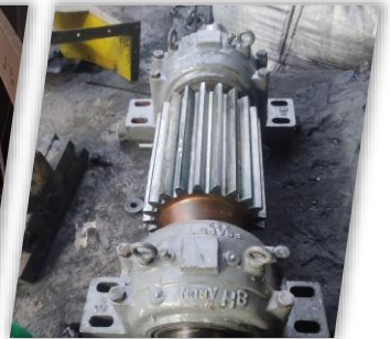
Pinion & Gear