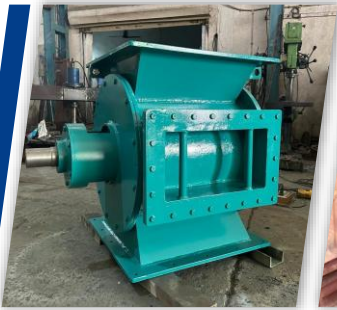
Rotary air- lock valve