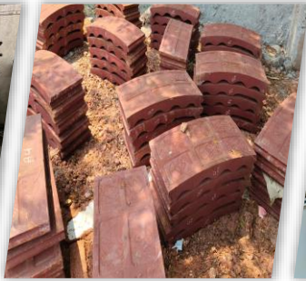
Ball mill Liner